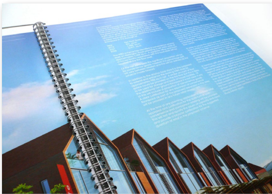
Wokingham Town Centre Regeneration