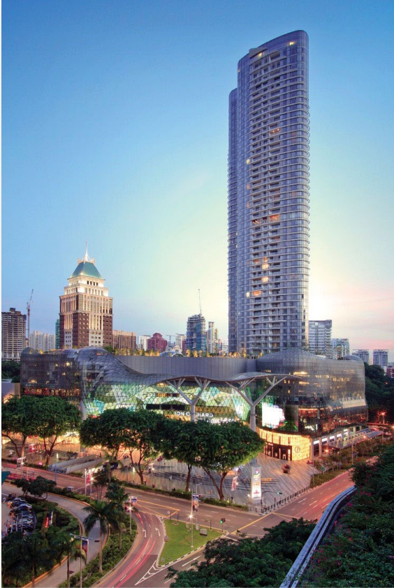
ION Orchard, Singapore