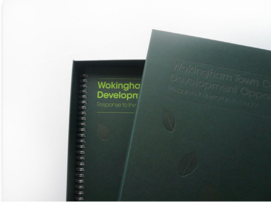
Wokingham Town Centre Regeneration

Perspective drawing and multiple artboard enhancements in Adobe Illustrator CS5 support corporate literature designs for clients that can help sell a new development. Simplified object selection and editing and multiple page sizes in Adobe InDesign CS5 help to improve efficiency when creating brochures and proposals.