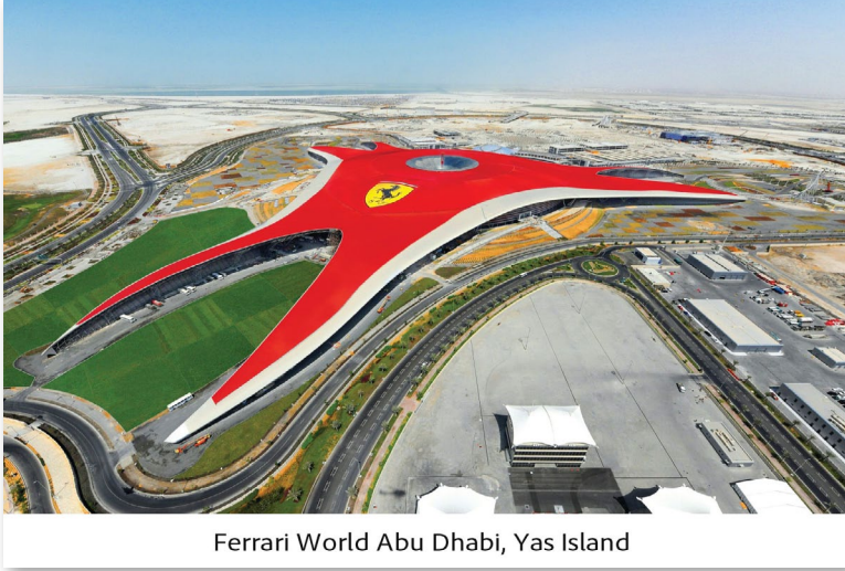
Ferrari World Abu Dhabi, Yas Island

Benoy designers use Adobe Creative Suite 5 Design Premium and Design Standard software—including Adobe Illustrator CS5, Photoshop CS5, and Photoshop CS5 Extended—to enhance artistic, detailed plans, renderings, and elevations of projects ranging from office buildings to theme parks.