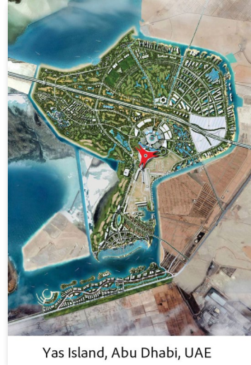
Yas Island, Abu Dhabi, UAE