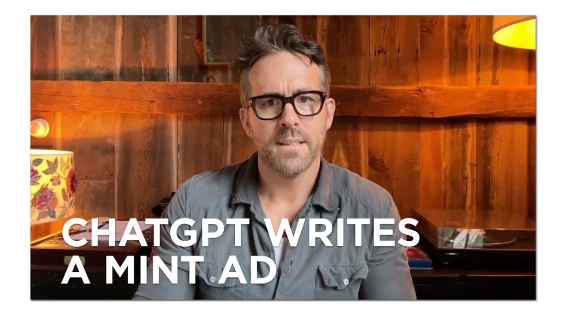
Figure 3 Mint Mobile And ChatGPT Wrote A Commercial Performed By Ryan Reynolds