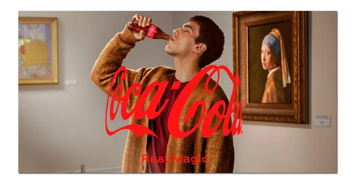
Figure 5 The Coca-Cola Company Produced Its "Masterpieces" Commercial Using Al Imaging