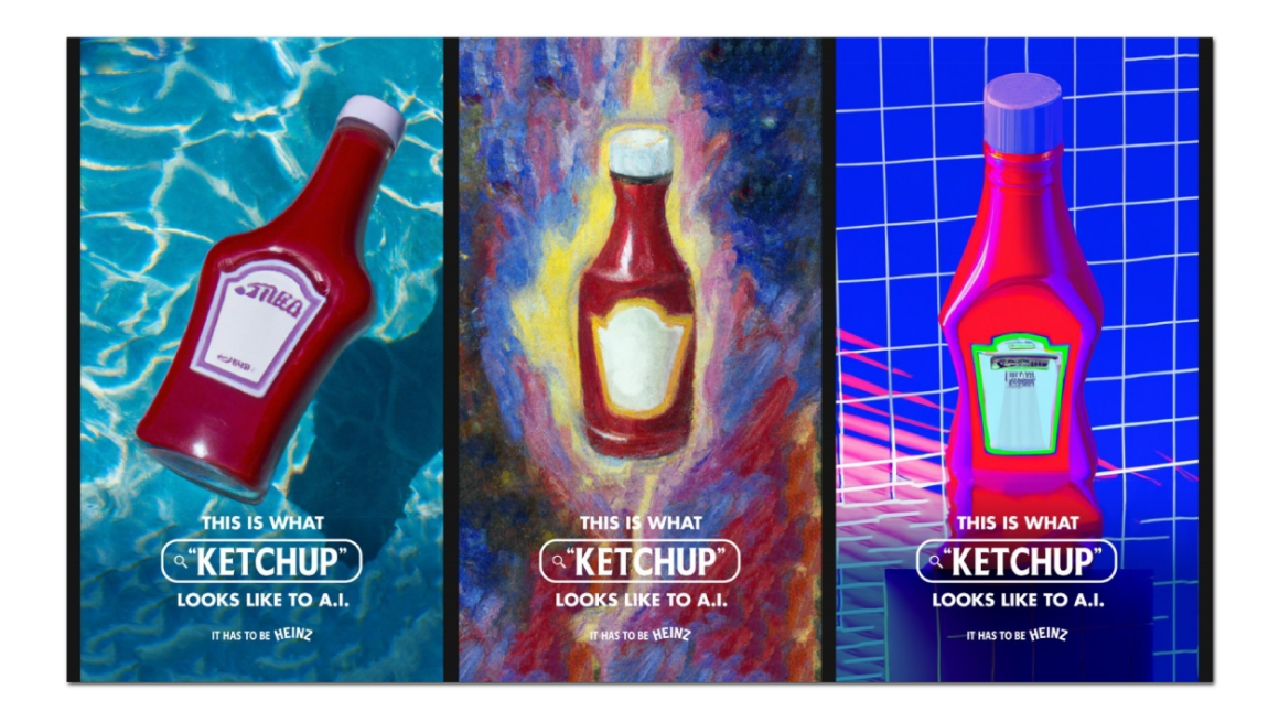
Figure 1 Kraft Heinz Enhances Choices And Concepts Using DALL-E Produced Images