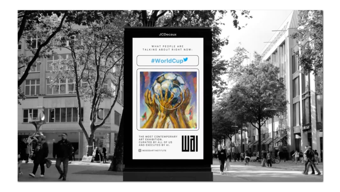
Figure 4 Woods Art Institute Used DALL-E To Curate Al Art Into "The Art Of Trending" Campaign