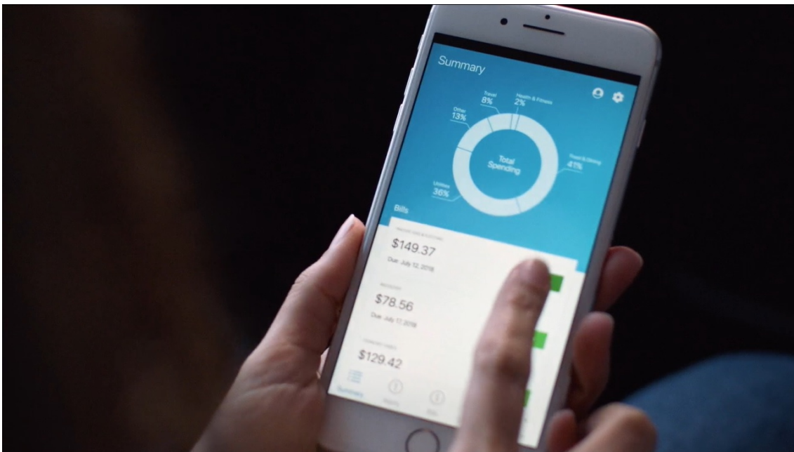
Image 1: The latest Adobe Real-Time CDP focus on speed, trust and relevancy.

Hong Kong — March 16, 2022 — At Adobe Summit - The Digital Experience Conference , Adobe (Nasdaq:ADBE) has announced new customers and innovations in Adobe Real-Time Customer Data Platform (CDP). Adobe Real-Time CDP is now the choice of industry-leading brands across all major sectors, including retail, healthcare, financial services, technology, as well as media and entertainment. With the innovations unveiled at Adobe Summit 2022, Adobe Real-Time CDP is even more powerful, with an array of capabilities that empower businesses to maximize the value of their customer data. Some of the latest brands that have chosen Adobe include Major League Baseball™, The Coca-Cola Company, Coles, General Motors, Dick's Sporting Goods, EY, Panera Bread, T.Rowe Price, ServiceNow, TSB Bank, Real Madrid and Suncorp.